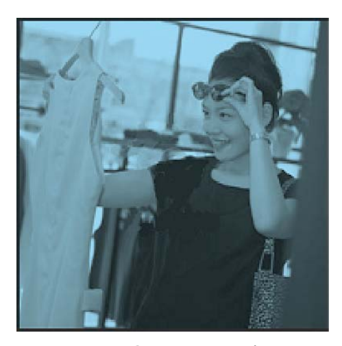
Figure 3.1: Customer satisfaction

Try to recall the main focus in the concept or definition of marketing. If you observe carefully, marketing puts much emphasis on attaining customer satisfaction. The success of marketers depends on their accomplishment in maximising customer satisfaction. If you take a look at the marketing activities of giant marketing organisations such as Toyota, Honda, Sony and 3M, you will see that they strive to ensure each marketing strategy is able to maximise customer satisfaction.