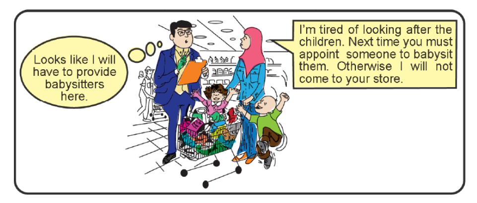
Figure 3.4: Customer retention

Customer retention refers to continuous efforts by marketers to maintain customers and get them to continue making transactions with marketers. The concept that must be avoided by marketers is the concept of lost customer. Both these concepts must be really understood and managed by marketers effectively.