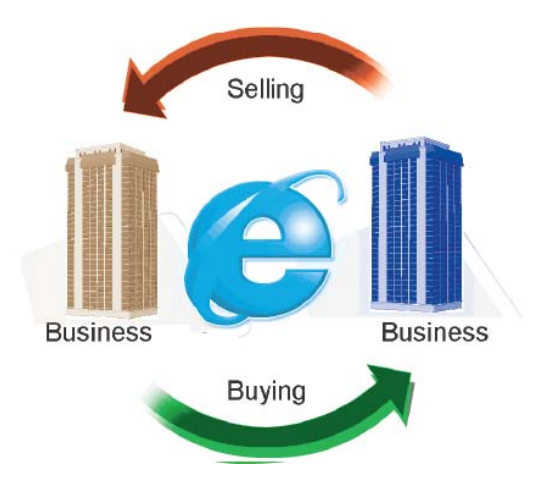
Figure 2.2: B2B model