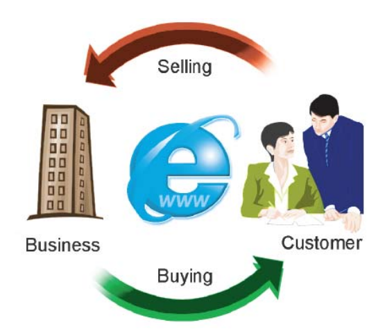
Figure 2.1: B2C model

B2C web page is the most useful in marketing goods and services when customers desire and prioritise the comfort of ordering or a lower buying cost. It is also useful when customers need certain information regarding the quality and price of certain goods and services. However, the Internet is least useful for products that must be felt or tested before purchasing. See Figure 2.1.