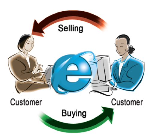
Figure 2.3: C2C model

C2C shows that online customers are becoming more efficient and frequent in circulating product information and no longer use goods or services alone. They join Internet interest groups to share and circulate ideas regarding products or services and suppliers. This has made C2C a main influencing factor in purchasing decision making by customers. See Figure 2.3.