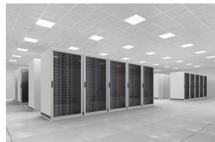
Figure 1.4: Mainframe

Mainframe is very large in size and is an expensive computer capable of supporting hundreds or even thousands of users simultaneously. Mainframe executes many programs concurrently and supports many simultaneous executions of programs.