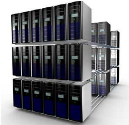
Figure 1.5: Supercomputer

For example, weather forecasting, scientific simulations, (animated) graphics, fluid dynamic calculations, nuclear energy research, electronic design, and analysis of geological data (e.g. in petrochemical prospecting).