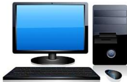
Figure 1.1: Personal Computer

A personal computer is a small, relatively inexpensive computer. It is designed for an individual user for personal or office use. The architecture of the personal computer is based on the microprocessor technology that enables manufacturers to put an entire central processing unit on one chip. The systems are also linked together to form a network. The personal computer can be categorised into the high-end and low-end based on its power. The high-end models of the personal computer are manufactured by Macintosh while the low-end workstations are manufactured by Sun Microsystems, Hewlett-Packard, and Dell.