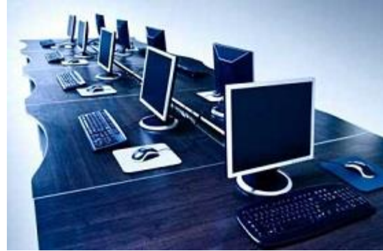
Figure 1.2: Workstation

The common operating systems for workstations are UNIX and Windows NT. Workstations are single-user computers like Personal Computer (PC) but are typically linked together to form a local-area network, although they can also be used as stand-alone systems.