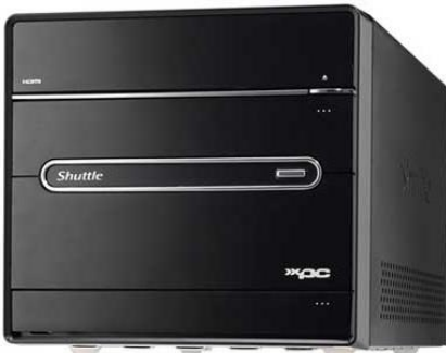
Figure 1.3: Minicomputer

It is a midsize multi-processing system capable of supporting up to 250 users simultaneously.